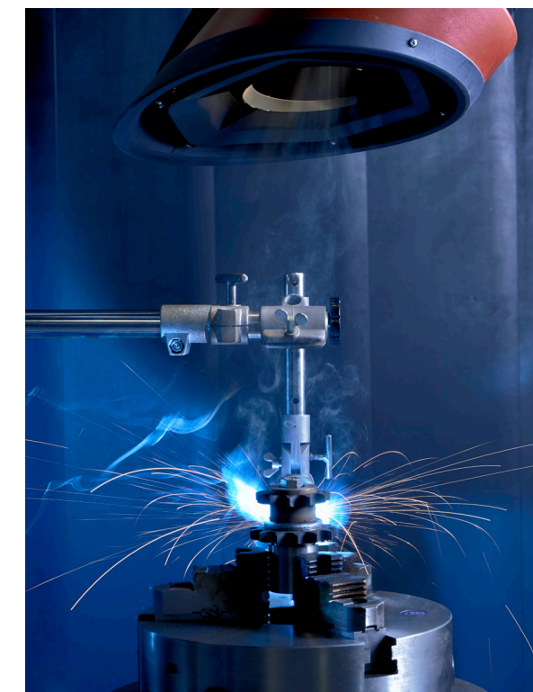
Automatic circular welding