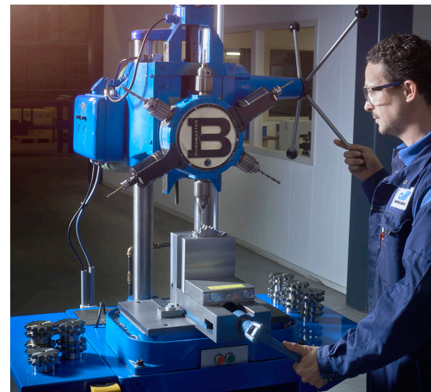
Set screw machining