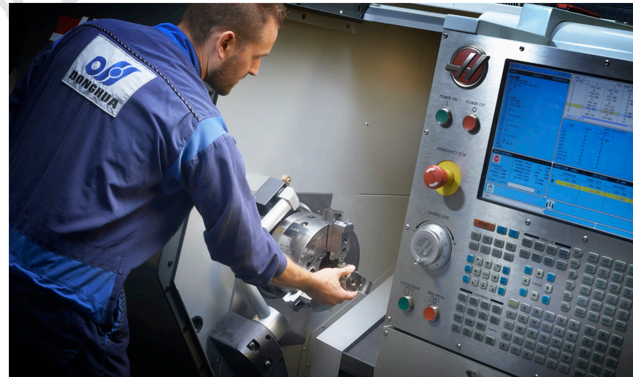
CNC sprocket production

Chains from Donghua are ISO9001-2000 and API certified.